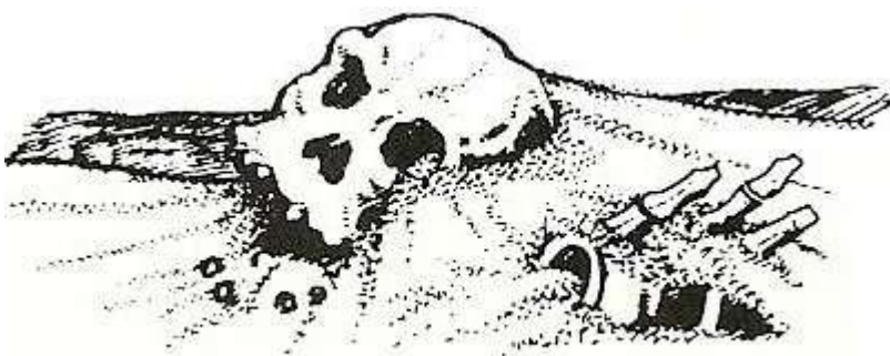
Illustrations on Instruction Sheet by Bill Houston.

Copyright subsists on the program. All rights of the producer reserved. Unauthorised broadcasting, diffusion, public performance, copying or re-recording, hiring, leasing, renting and selling under any exchange or repurchase scheme in any manner is prohibited.